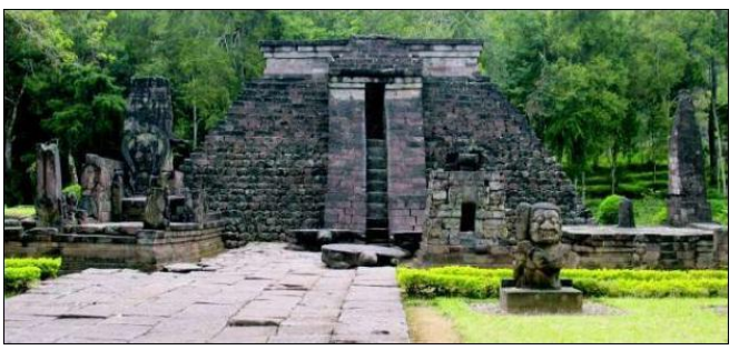
Figure 4 - Sukuh Temple in Indonesia, thoudsands of miles away from the Mayan temple above.

Also, and perhaps more importantly and the probable root of the previous example, people tend to elevate certain symbolic items and concepts above their proper level of importance. A cow may represent to someone the sensual pleasure of eating beef or a source of fertility, while chopping off the head of that cow may