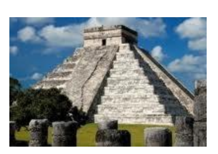
Figure 3 - Mayan Temple, Central America.

You have the same brain as a "primitive" tribesman, and you tend to have