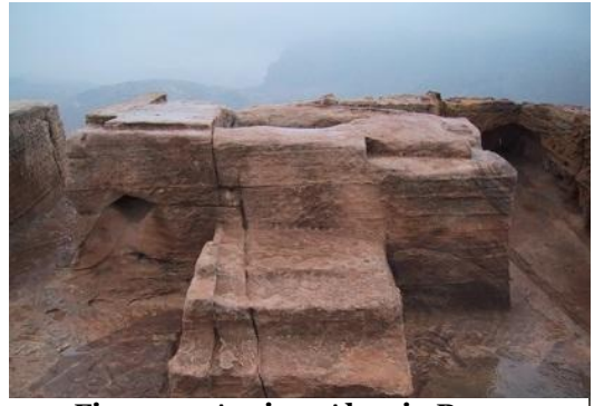
Figure 2 - Ancient Altar in Petra

Though there is no question that a developed, educated mind is a better one and can think more rationally, the same psychological traces of pagan humanity that are on a more conscious level when an African tribesman [4] is slaughtering a