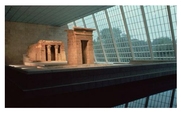
Figure 1 - Temple of Dendur at the Metropolitan Museum of Art.

intriguing Maimonides has an approach understanding the to commandment of animal sacrifice. If one understands the depth of his utilizing approach, through contemporary psychological insight to elucidate, one can glean tremendous insight into much of human behavior